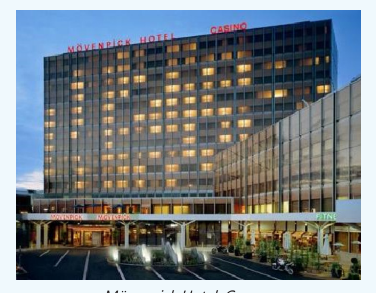
Mövenpick Hotel, Geneva

Check-in time is from 2.00 pm. Check-out time is 12.00 noon. For more information please visit the hotel website.