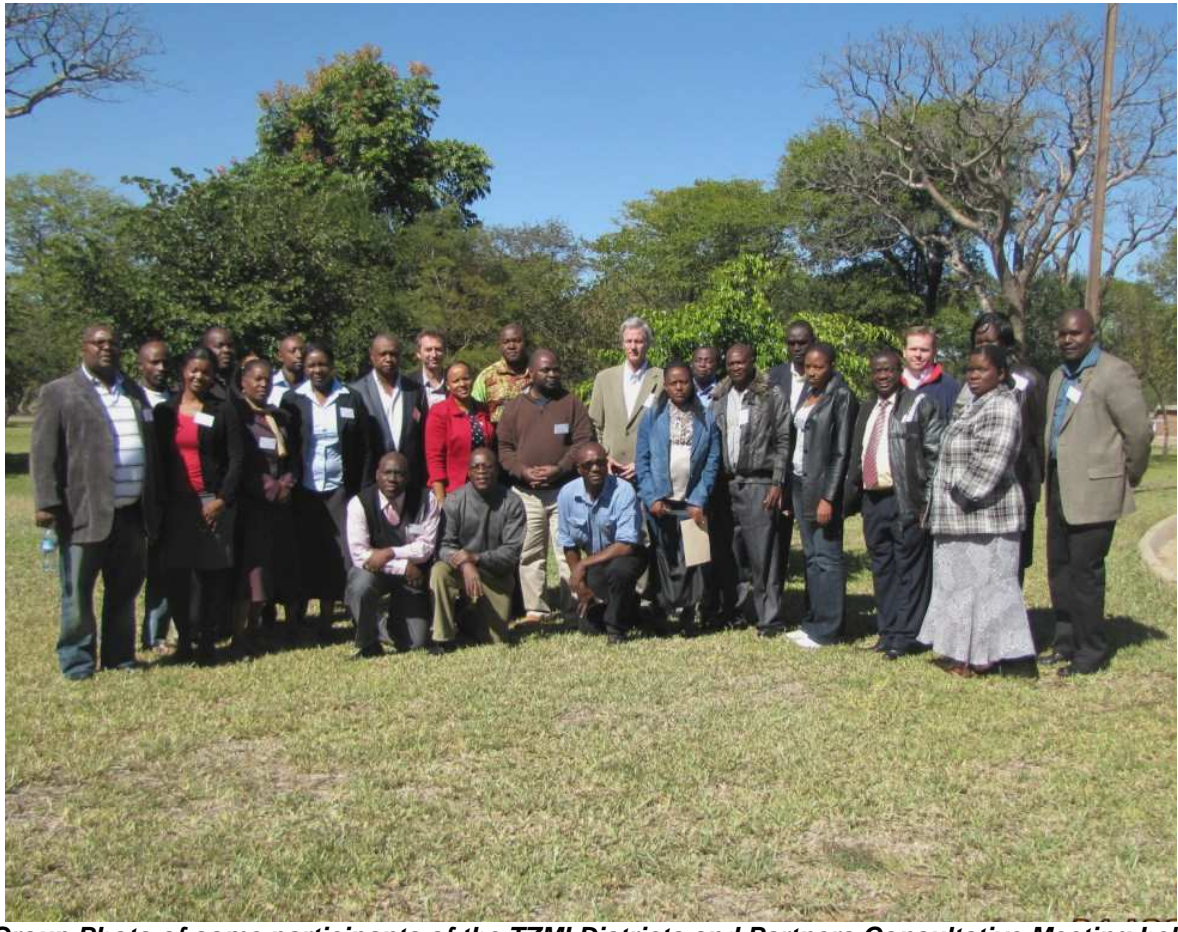
Group Photo of some participants of the TZMI Districts and Partners Consultative Meeting held at the Chrismar Hotel, Livingstone, Zambia

The main focus of the Livingstone meeting revolved around delivery of the end products: Joint TZMI action/operational plan; TZMI districts plan with activities for harmonization and synchronization of the activities. Emphasis was also put on Active Case Detection (ACD), data management, and baseline survey, BCC/IEC, Coordination and communication. All these activities are aimed at reducing transmission to near zero by 2013 and malaria elimination by 2015 in the TZMI districts. The presenters and facilitators were selected from a country, regional and global pool of experts who would ensure a focused meeting that was going to deliver the planned outputs/products. These would guide group work sessions in line with their expertise. The first group work concentrated on working with districts to determine activities that they are not currently implementing and would want to start implementing. These activates would form the core activities for harmonization and synchronization.