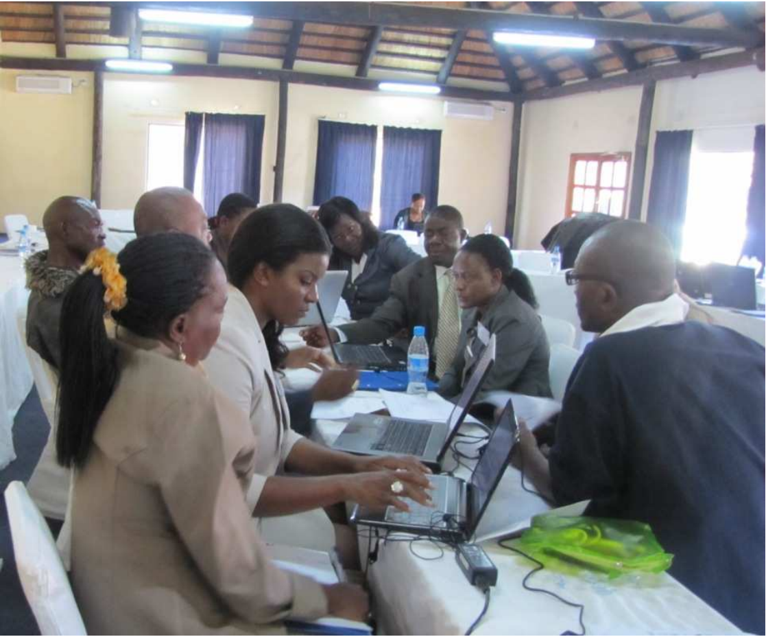
Districts teams revising their Work Plans