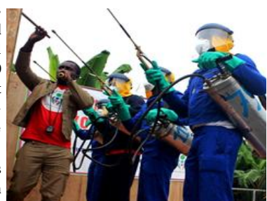
The IRS team